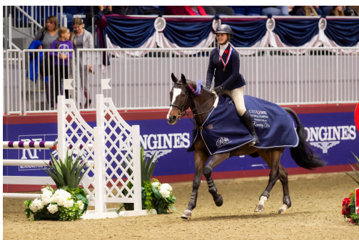
Bred in Canada

We are very excited that this step should lead to a stronger connection between breeders and competitors, to the benefit of the industry moving forward.