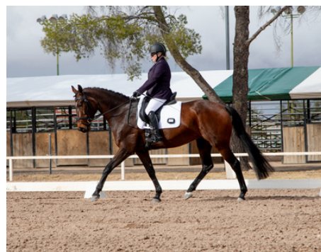
Working for Canadians